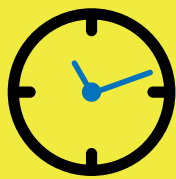
Can you travel off-peak?