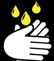
Wash or sanitise your hands as frequently as possible