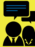
If you require assistance you should continue to request this as you normally would