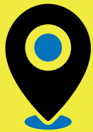
Plan ahead and use a direct route