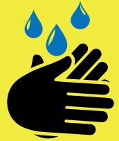
Wash or sanitise your hands before beginning your journey