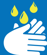
Wash or sanitise your hands as soon as possible