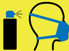
Take hand sanitiser and a face covering, if you can