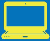
Working from home

Before you travel you should consider whether your journey is necessary. You can reduce pressure on the public transport system and road network by: