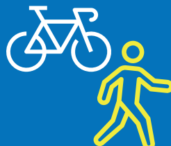
Walk and cycle from public transport to your destination, where possible