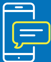
Follow guidance at your destination

When finishing your journey, you should: