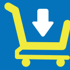
Shopping locally and less frequently