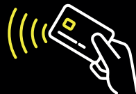
Use contactless payment where possible