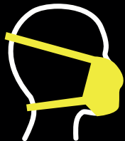
Use a face covering, if you can, when you will be close to others