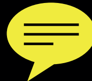
Be patient and follow instructions from transport staff